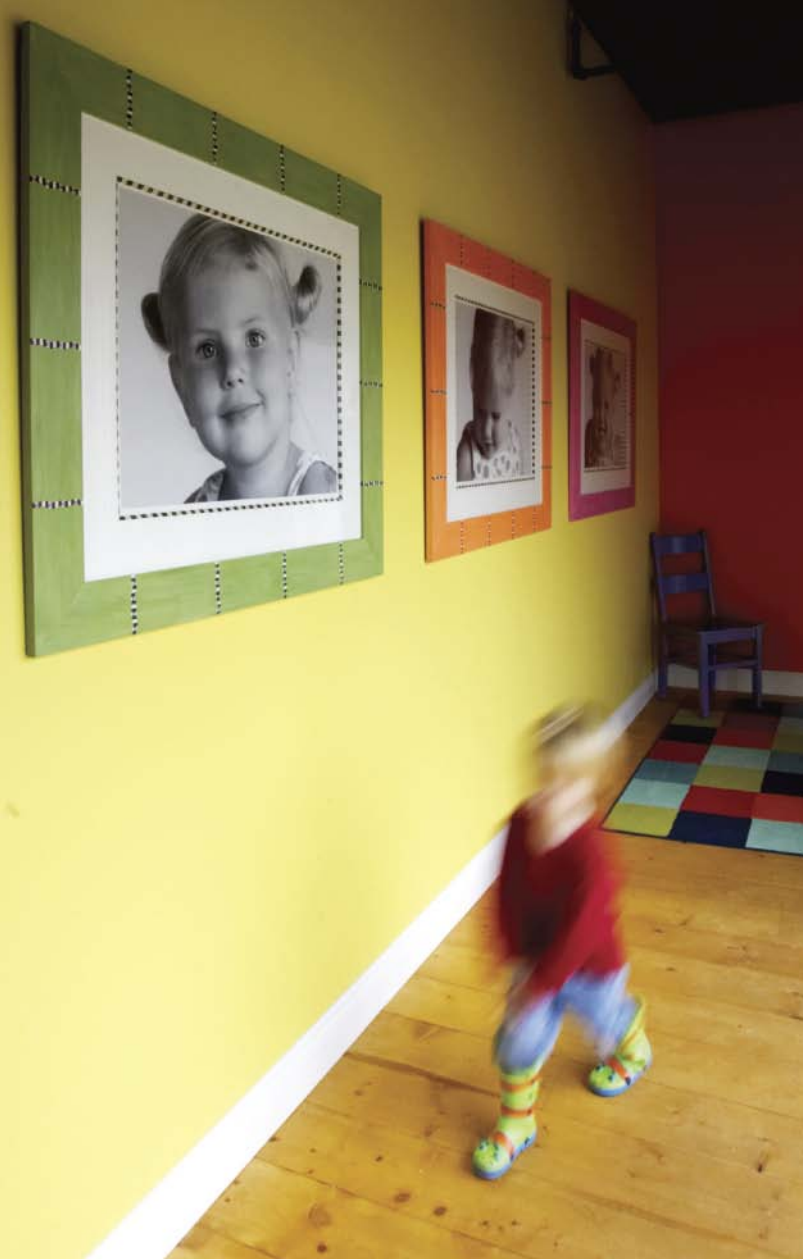
If you want to sell wall portraits, you have to show wall portraits.