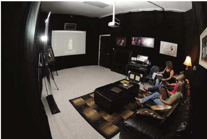
Presenting your images in a digital slide show, rather than sending clients home with paper proofs, has some big advantages for photographers. Here, we see customers relaxing in the projection room at Chatsworth Portrait Studio.

allow you to attach an audio file and then sync your images to the music so they will end at the same time. Royalty free music is available all over these days, so check out what is out there and select some music that captures your style—and their emotion! Make sure that the style of your show reflects the taste and personality of the customer you are with at the time, as well as the type of session. You don't want to use an upbeat rock song with twangy guitars and heavy drums if you are showing heartwarming images of a newborn baby.