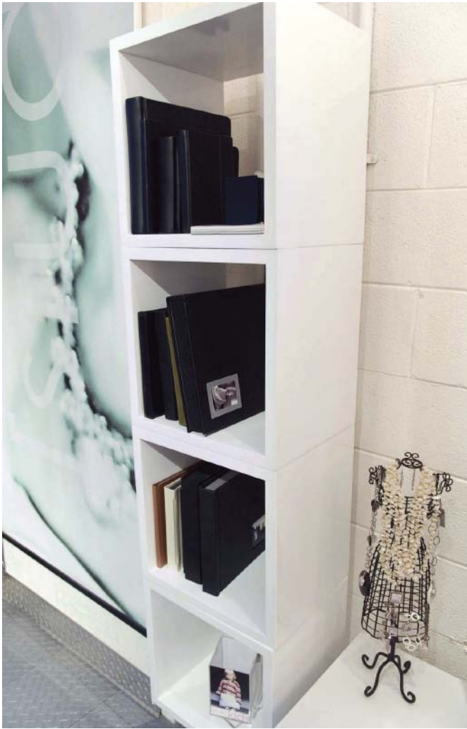
People are more inclined to buy things they can see and touch. So if you want to sell albums, make sure you have a selection of them displayed attractively.

things they can see around the room. Anything that you want to sell should be on display in your showroom—and nothing smaller than a 16x20-inch print should be visible. If they want to see what one of those big ol' 8x10s looks like, you can direct them to an album. People are more inclined to purchase items that they can see and touch than products that they are only told about. So make sure you display the products and sizes that you want to sell. Wall collections, digital composites, wall folios, family lifestyle albums—whatever products generate good profits for you and give them a memory they can cherish.